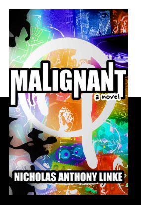
MALIGNANT: a novel